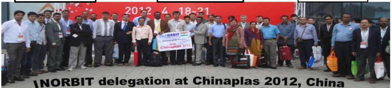
INORBIT delegation at Chinaplas 2012, China